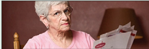
ELDERLY AND DISABLED INCOME