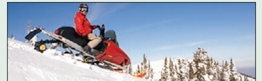
ATVs AND SNOWMOBILES

All proposed tax increases and repealed credits from the 2009 House Omnibus Tax Bill HF2323.