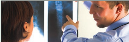
EMPLOYEE HEALTH INSURANCE