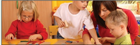
CHILD AND DEPENDENT CARE